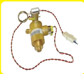
Start up unit GHK-10WT

replace within 5 years after installation