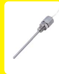
Heat detector THIS-10

replace within 5 years after installation