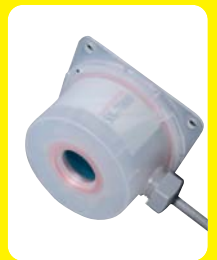
Flame detector SX-7000